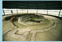
The Relic Stupa I