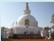
The Shanti Stupa

After early breakfast, proceed towards Rajgir (2 Hrs) and Nalanda. Visit the Shanti Stupa, Gridhrakuta Hills, Nalanda University and Museum. After Lunch proceed to Vaishali for Night stay.