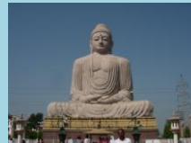
80 Ft Buddha Statue