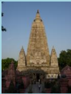
The Mahabodhi Temple

Bodhgaya, where the Buddha attained enlightenment and became the Buddha. Whole day at Bodhgaya. Morning visit Mahabodhi Temple. After Lunch proceed towards Dungashwari Caves (12 Kms), Sujata House and Niranjana River. Evening free. Night stay at Bodhgaya.