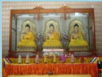
Buddha Image - Chinese Temple

Arrival at Gaya Airport. Arrangement for transfer to Hotel at Bodhgaya. In the Afternoon visit the Thai, Chinese, Tibetan, Japanese Temples and The 80 Ft. Buddha Statue. Night stay at Bodhgaya.