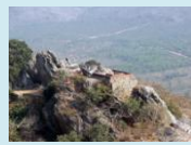
Gridhrakuta Hill (Vultures Peak)