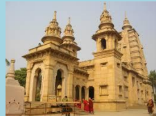
Mulagandha Kuti Vihara