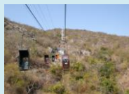
Ropeway at Rajgir