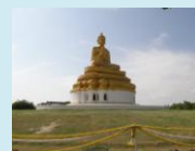
Buddha statue at Sravasti