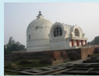
The Nirvana Stupa and Mahaparinirvana Temple