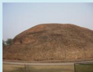
The Ramabhar Stupa

Morning sightseeing at Kushinagar. Visit the Ramabhar Stupa, The Nirvana Stupa and the Mahaparinirvana Temple. Then proceed to Lumbini (4 Hrs). Night stay at Lumbini.