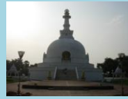
The Shanti Stupa