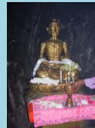
Buddha Image at Dungeshwari Caves