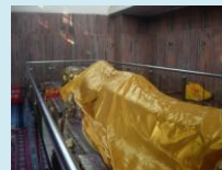
the Buddha in a reclining position