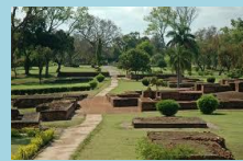
Gardens at Lumbini