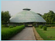
The Relic Stupa I

At Vaishali visit the Relic Stupa, Kutagarasala Vihara, and The Vishwa Shanti Stupa. Then proceed towards Kushinagar (6 Hrs). At Kushinagar check in at Hotel for night stay.