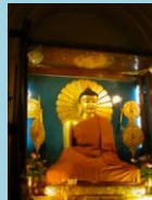
The Buddha Image – Mahabodhi Temple